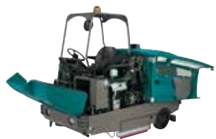
EASY OPEN SERVICE

EZ-Remove™ debris tray glides in and out on wheels, improving productivity and operator safety. The convenient and sturdy handle simplifies debris transport and disposal.