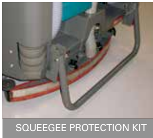
SQUEEGEE PROTECTION KIT

Achieve outstanding cleaning results in the harshest industrial environments with dual cylindrical brushes or three gimble mounted disk brushes for aggressive cleaning.