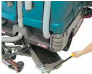
EZ-REMOVE DEBRIS TRAY

Lower maintenance and repair costs with a heavy-duty rear squeegee protection kit that prevents damage to the machine.